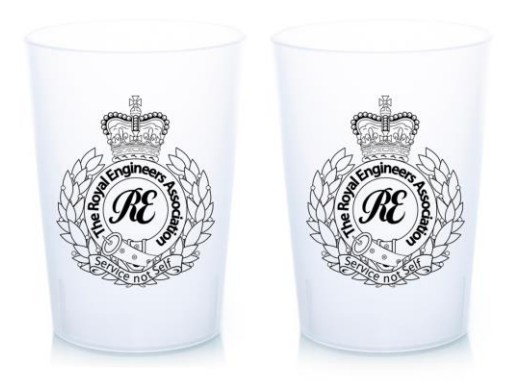
Figure 1. Reusable cup to purchase (reference image)

usable and re-cyclable cup; these will be sold during the event at a very reasonable £2 – please refer to Figure 1 <u>reference image</u> below. Guests will be requested to kindly purchase a cup for the Meet and Greet function; additional cups are available to purchase if required.